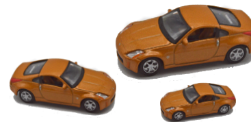
You can move O, OO, HO, N & Z scale!