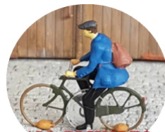
ALL BICYCLES REALISTICALLY PEDAL