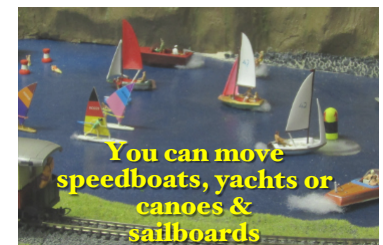
You can move speedboats, yachts or canoes & sailboards